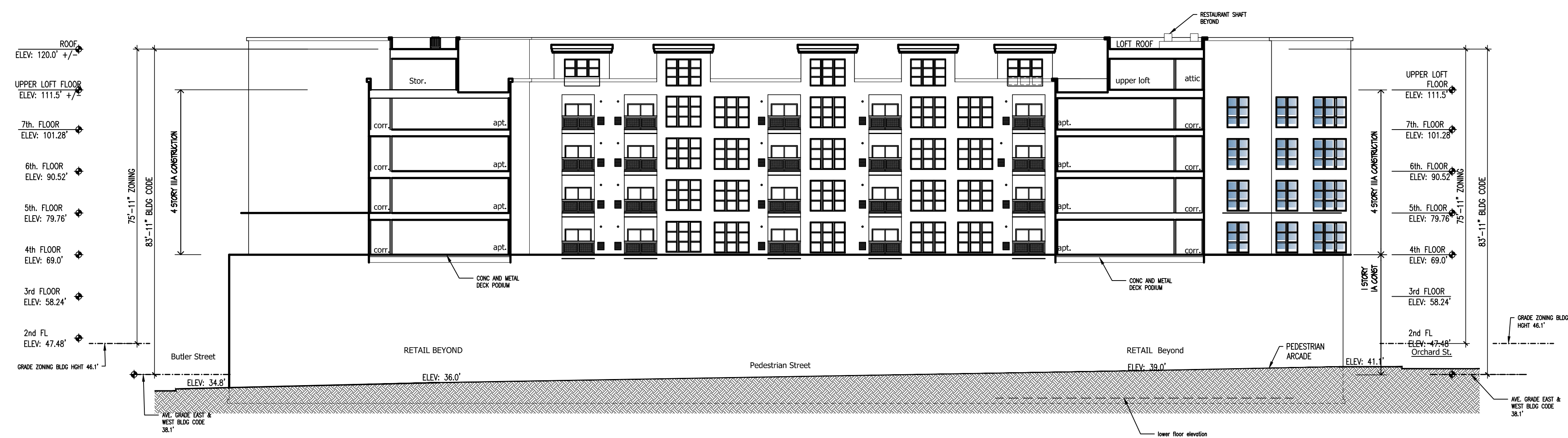
2 BUILDING SECTION 1 1" = 20'-0"