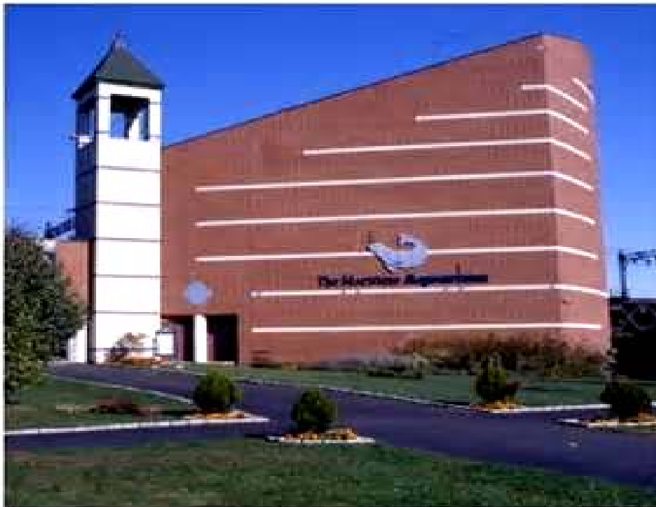
IMAX Theater at the Maritime Aquarium