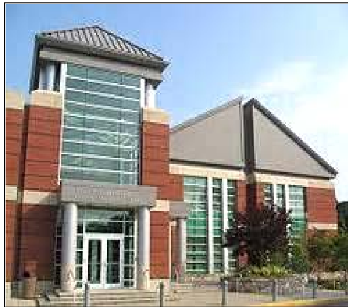
Norwalk Community College