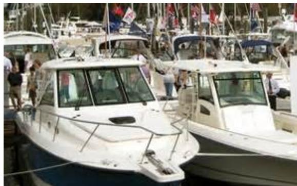
Norwalk's In-Water Boat Show