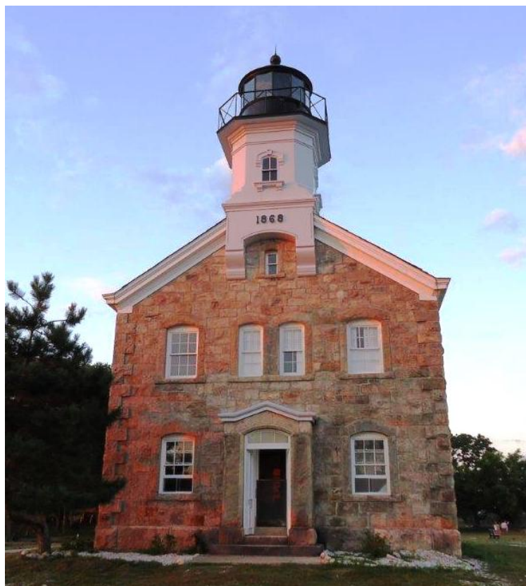
The Sheffield Island Lighthouse

Norwalk is a Connecticut coastal community steeped in history, arts and innovation. Its stimulating lifestyle, attractive amenities and welcoming environment appeal to businesses of all sizes as well as residents and visitors of all generations and cultures. Norwalk: where life meets opportunity in the digital age.